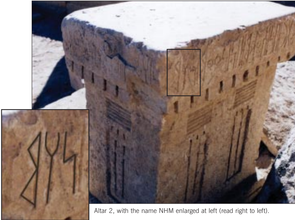
Altar 2, with the name NHM enlarged at left (read right to left).

stages of construction into an ever more substantial temple complex. The three altars donated by Bi'athar appear to precede or belong to a fourth period of construction beginning in the late sixth or fifth century B.C., at the height of the influence of the Sabaean kingdom. The date has been further refined by the altar texts themselves, which refer to the ruler Yada c -il, who is likely Yada c -il Dharih II (about 630 B.C.) or perhaps Yada c -il Bayyin II (about 580 B.C.). 11 This places the making of the altars within decades of the time that the Lehitese made their desert odyssey.