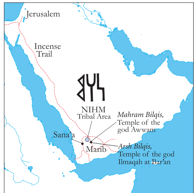
The distance from Jerusalem to the Nahom region and the nearby city of Marib is approximately 1,400 miles.

ences to it in the Old and New Testaments, the Talmud, and the Qurʿan. 7