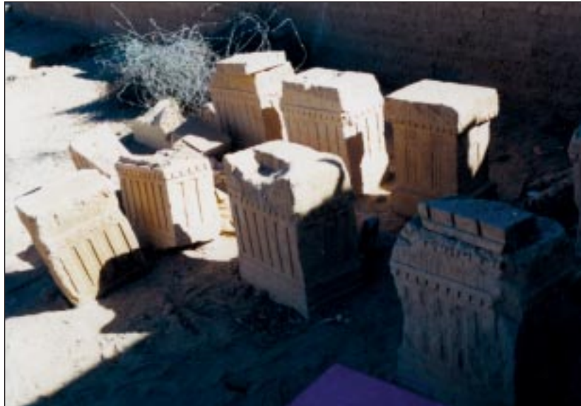
Altar 3, the third altar inscribed with the NHM name, stands in the back row on the right. This altar has been moved to the raised sanctuary of the Bar'an temple.

The altars are not identical. For example, compared to altar 1, altar 2 has more damage to its corners, exhibits 11 rectangular "tooth" shapes below the text on each long side instead of 12, and has five horizontal ridges above the window-shaped recesses instead of four. Likewise, altar 3 has some extensive damage on its sides. Moreover, the text is positioned slightly differently around the sides of all three altars.