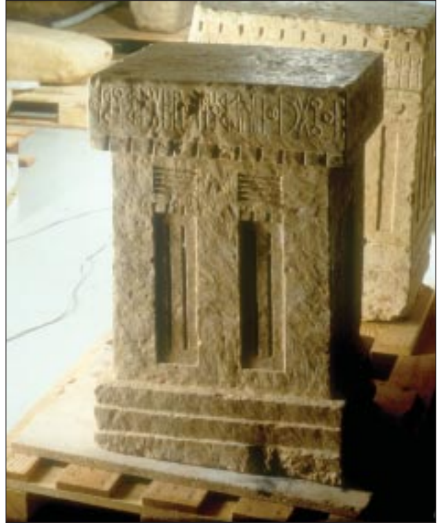
Altar 1, on which the name NHM was first identified, is currently on tour with the Queen of Sheba exhibit in Europe.

If in fact Nahom extended into this region in ancient times, this burial area now takes on special significance. The tombs date back as far as 3000 B.C., evidence of the large population in the area even earlier than the generally accepted dates of the Sabaean period, when Marib was at the height of its influence in the region. Could this unique site be the actual scene of “the place which was called Nahom”—the actual burial area referred to by Nephi?