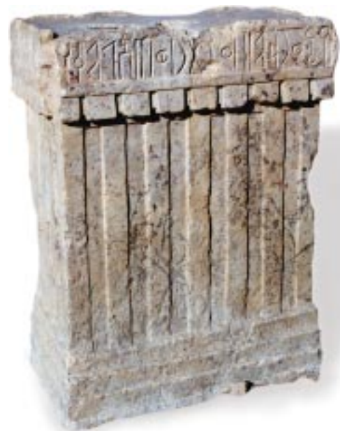
The second altar with the NHM name stands solitary in the forecourt of the Bar’an temple east of Marib. Right: A typical altar from the Bar’an temple.

two altars in an exhibit on ancient Yemen touring Europe since October 1997 and could no longer be examined at the Bar’an temple site. 5 Although a photograph of the altar appeared in the commemorative catalog accompanying the exhibit, the full engraved text—including the actual reference to Nihm—was not visible in the photograph, and readers had to be content with the translation provided in the catalog’s caption. Since then, however, two additional altars bearing the name Nihm have been identified at the same temple site.